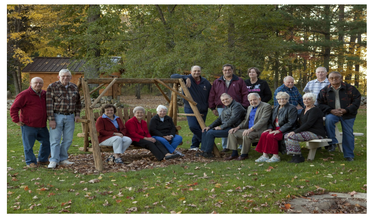
Recent gathering of CERA & CERF Boards of Directors

Non-Profit Organization U.S. Postage Paid Stillwater, MN Permit # 788