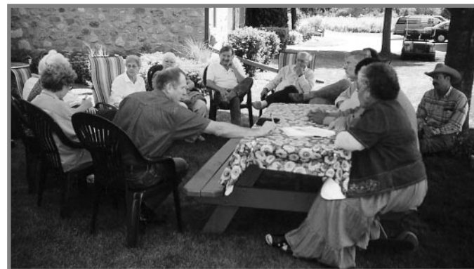
An informal CERA organizational discussion in the shade.